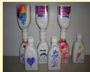
Here is what you need:

The Plastic formula bottles need to be washed and dried thoroughly.. The children would color them and would also add colors, shapes, numbers, letters etc. on different bottles. For fine motor skills the children would stack them and balance them on the caps or the more solid base of the bottle. We would try to knock down the bottles with a soft ball or the infants would just stack and knock them down. What fun we had making them and playing!