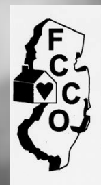
Family Child Care Organization of New Jersey