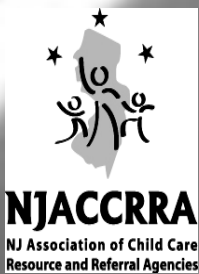
NJ Association of Child Care Resource & Referral Agencies