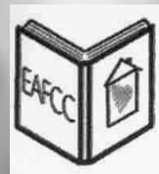
Educational Association for Family Child Care